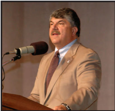
Richard Trumka Speaking