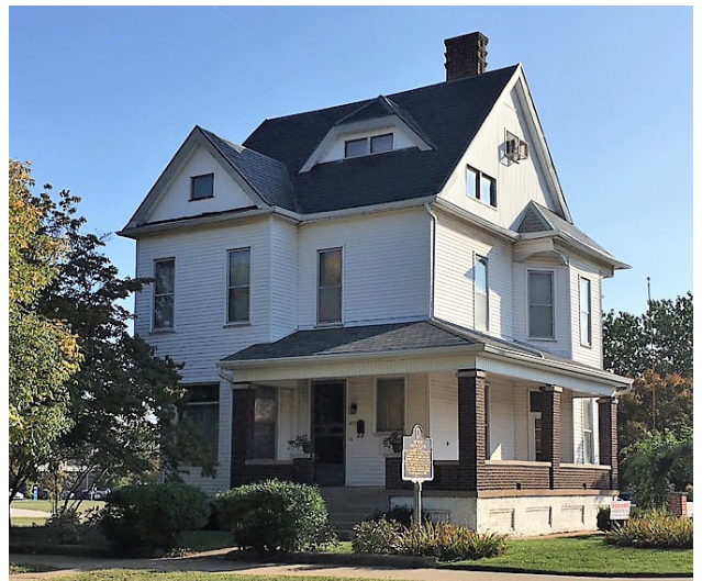
451 North 8th Street Today