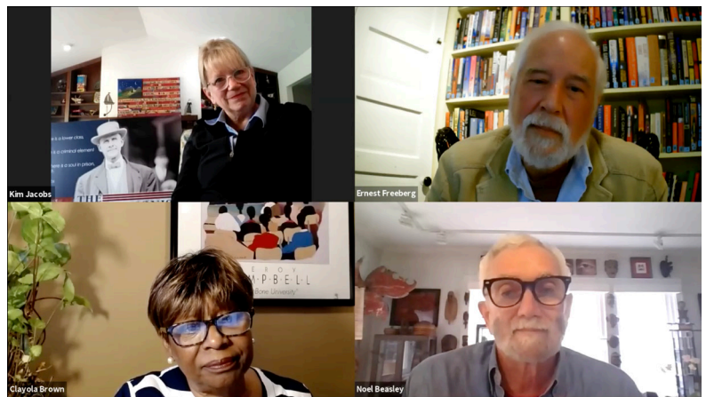
Virtual panelists described Debs' impact