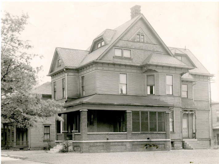
The Debs home as it appeared c. 1920

When Kate and Eugene Debs first purchased a residential lot on North 8th Street in Terre Haute, they had no way to anticipate that their nascent home would, within mere decades, become a nationally recognized site of pilgrimage, and education, and preservation. They built a fine house, not a museum, but the Debses' combined contributions to their causes are more than deserving of such commemoration.