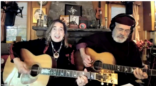
Acclaimed duo Magpie closed the program

In the weeks leading up to the program, we asked social media followers to record videos of themselves describing what Debs means to them today. Responses included "class solidarity," "decency, empathy, and compassion," "humanity," and "hope for a world where economic justice is possible." With submissions from Seattle to Atlanta, the compiled videos imparted a collage of personal meaning to the program.