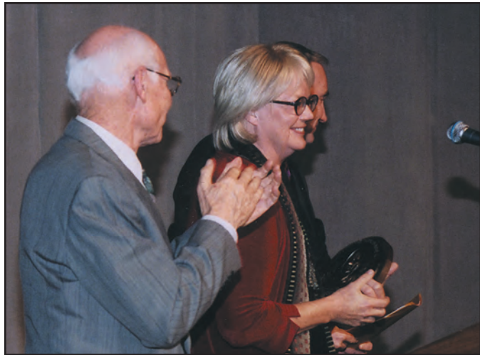
Molly Ivins acknowledges applause upon receiving the plaque.