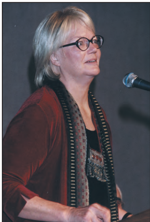
She held us spellbound for 45 minutes, laughing or applauding.