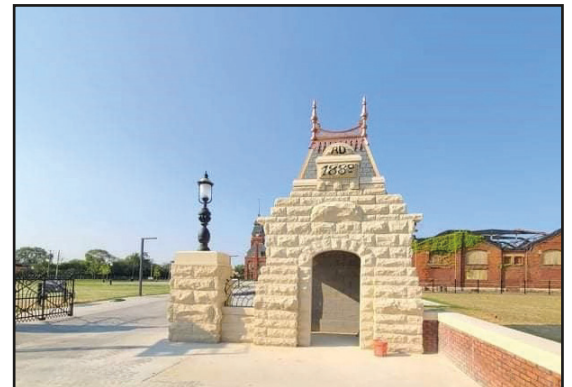
The Pullman factory gate invokes a not-so-distant past.