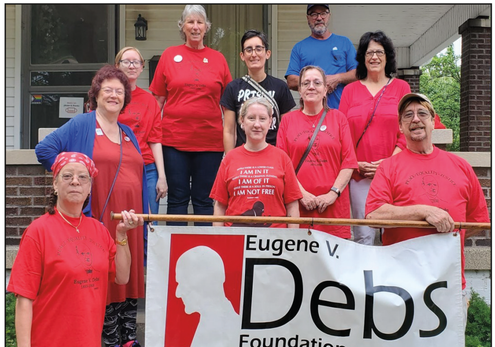
Labor Day Paraders assemble at the Debs House before stepping off downtown.