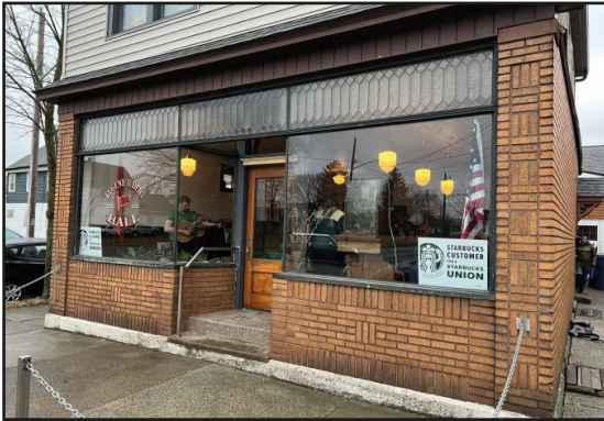
The Debs Hall keeps labor history alive in Buffalo, NY.